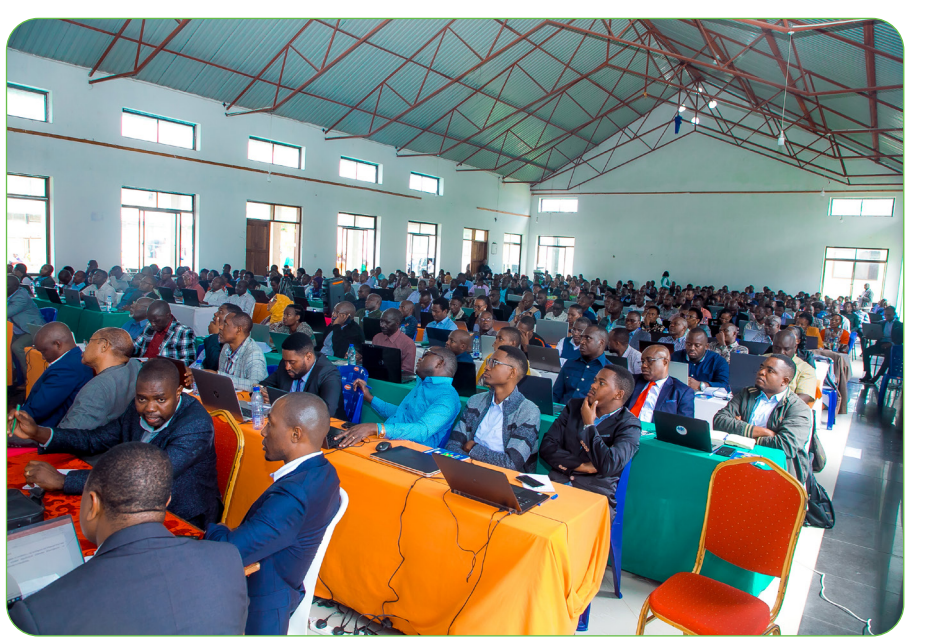
Participants at the User Acceptance Test for NeST, this week in Iringa